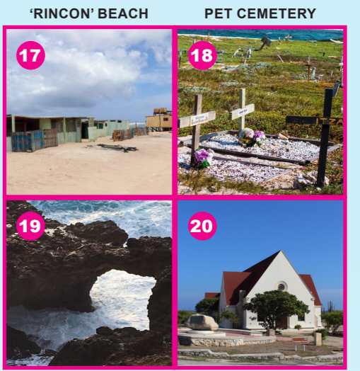
'RINCON' BEACH PET CEMETERY NATURAL BRIDGE SEROE COLORADO COMMUNITY CHURCH