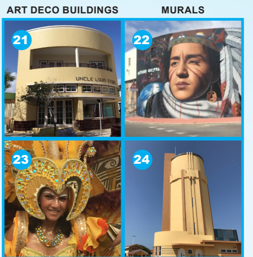
ART DECO BUILDINGS MURALS CARNAVAL EUPHORIA MUSEUM OF INDUSTRY