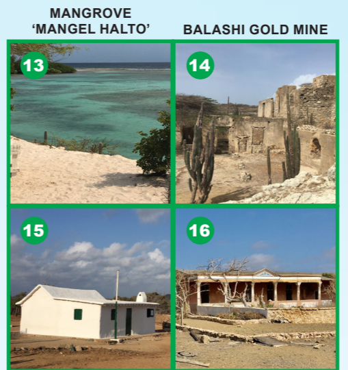
MANGROVE 'MANGEL HALTO' BALASHI GOLD MINE NATIONAL PARK ARIKOK PLANTATION 'FONTEIN'