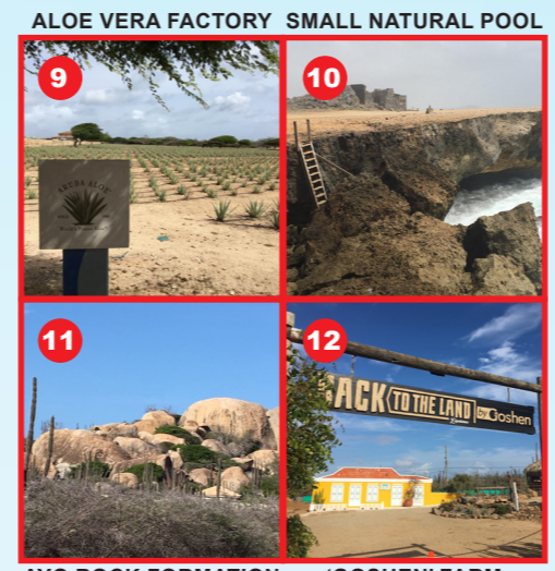
AYO ROCK FORMATION 'GOSHEN' FARM