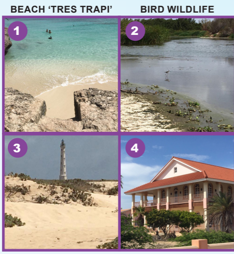
ARASHI DUNES FOREIGN HEADQUARTER EAGLE-REFINERY